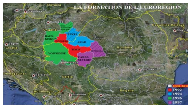
Figure 1. Steps of forming the DKMT Euroregion

Established by the association of three surrounding statistical territorial units (equivalent to NUTS 2) around the nucleus of the old and famous historical province of Banat, it exceeds the area and population of many countries in Europe (Popa, 2006). The DKMT Euroregion is currently made up of three counties in Romania (Arad, Timis and Caras-Severin), two counties in Hungary (Bács-Kiskun and Csongrád) and the Autonomous Province of Vojvodina in Serbia. The steps of forming the DKMT Euroregion can be seen in figure 1.