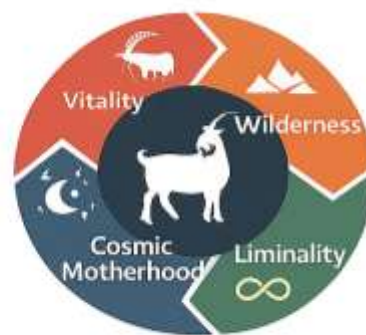
Figure 4. Mythological roles of goats