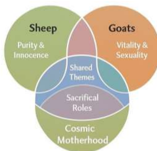
Figure 5. Comparative binary opposition