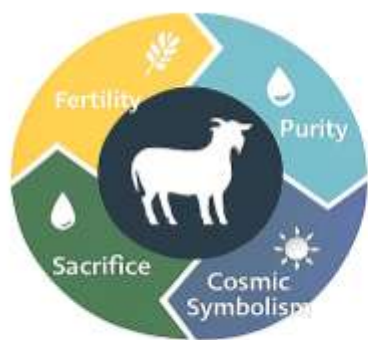
Figure 3. Mythological roles of sheep