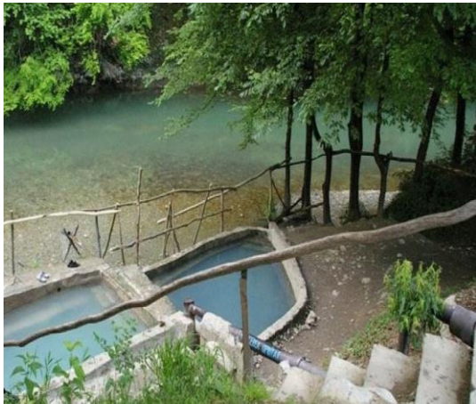
Figure 6. Thermal springs