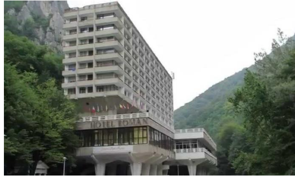
Figure 4. Roman Hotel