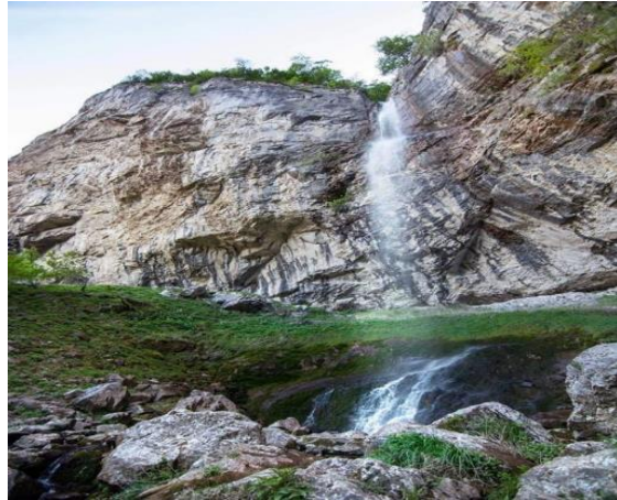
Figure 7. Vanturatorea Waterfall