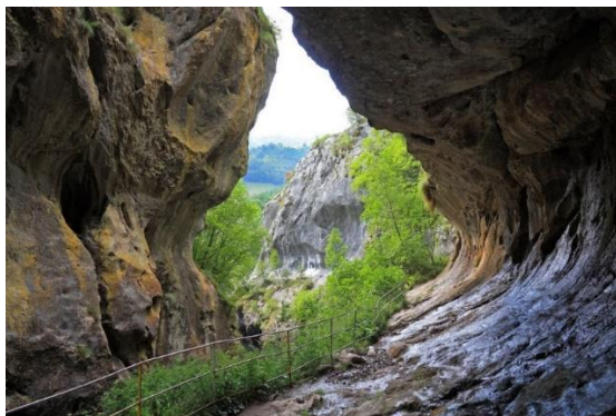
Figure 8. Domogled National Park

It is a protected area with outstanding biodiversity, including rare plant and animal species, as well as spectacular natural landscapes.