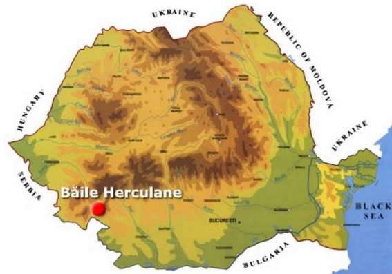
Figure 1. Location of the Herculaneum Baths on the map

For those who want to reach Herculaneum by plane, the closest option is Timișoara Traian Vuia International Airport, located approximately 170 kilometers away. From the airport, one can rent a car or opt for public transport or shuttle services to Herculaneum.