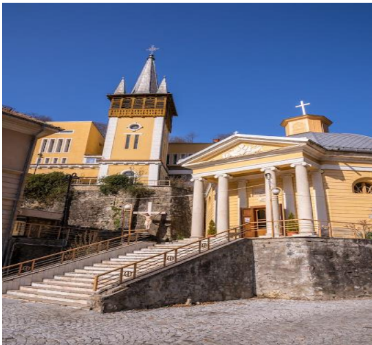
Figure 12. The Roman Catholic Church

An 18th century building, built in the Baroque style, being a testimony of the Habsburg period in this region. Its interior is simple, but retains original architectural elements.