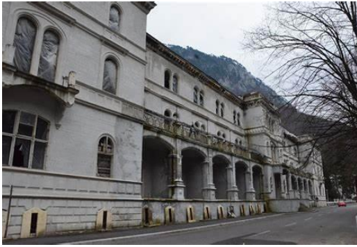
Figure 3. Decebal Hotel