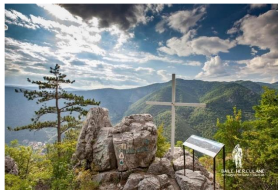
Figure 9. The White Cross