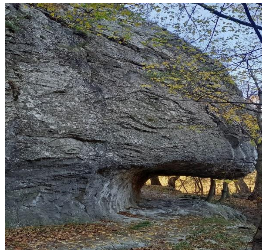
Figure 13. Stone Hut