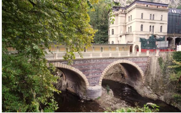
Figure 11. The Stone Bridge