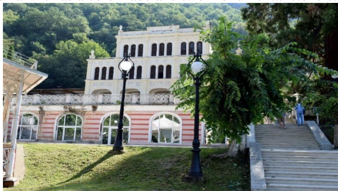
Figure 2. Casino

Casino: the casino was built between 1862-1864 by the architect Wilhelm von Doderer, at the request of Emperor Franz Joseph I (1848-1916). The building was equipped with a dance hall, a restaurant on the ground floor, and on the first floor, a casino and a performance hall. It has a colonnade and two monumental stone stairs. [17]