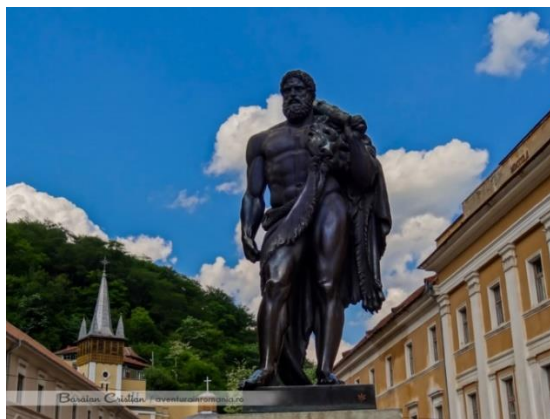
Figure 5. Statue of Hercules