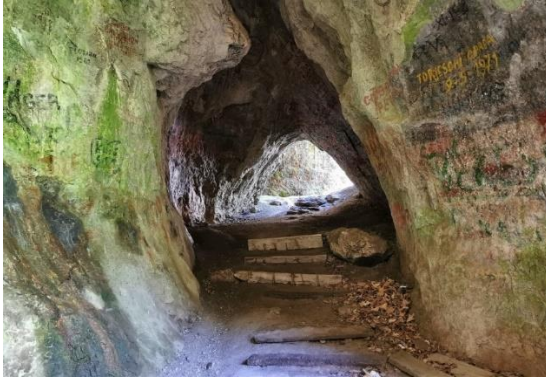
Figure 10. Cave of Thieves

A cave located a few kilometers from the resort, accessible by a hiking trail. The cave has a mysterious history, being linked to stories about thieves who hid here in the past.