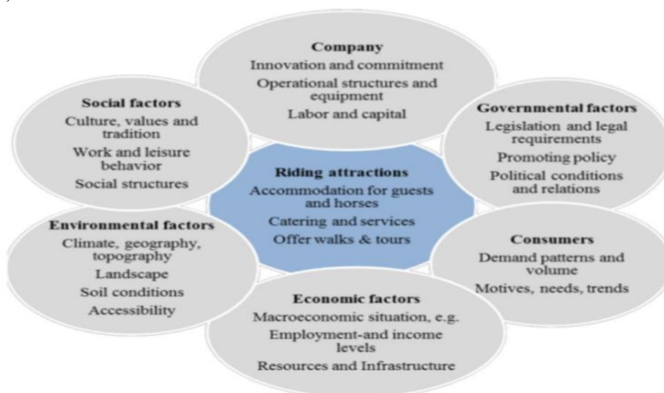
Figure 2. Factors determining the type, quality, feasibility and attractiveness of riding attractions [18]

Along with the increase in the number of tourists, the interest in equestrian tourism also increases. Many tourist destinations can be promoted with horse and buggy tourism solutions, especially in places that are difficult to reach by car or public transport [2]. The possibilities and success of the development of such attractions depend on many factors (Figure 2).