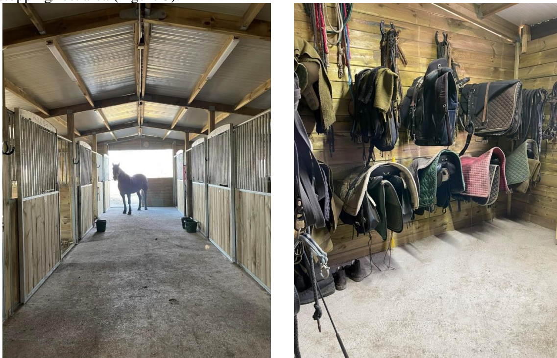
Figure 3. The stable of the local rest area of the equestrian route

A total of 6 horses (3 Hungarian half-breeds, 3 Nonius) are kept in the settlement of Kétpó, of which four (1 Hungarian half-breed and 3 Nonius) can be found at the stopping/rest area (Figure 3).