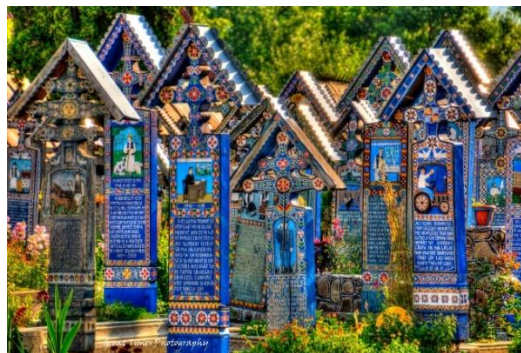
Figure 9. Sapanta Vessel Cemetery

4. Sapanta Vessel Cemetery. The fame of Sapanta was brought by the original works of folk art, creations of master Ion Stan Patras. It is said "cheerful" because on the crosses crafted and colored by Stan Patras are rendered, in caricature drawings, painted in bright colors, the defects, as well as the good parts, capturing scenes or significant moments that characterize the life of the one who disappeared.