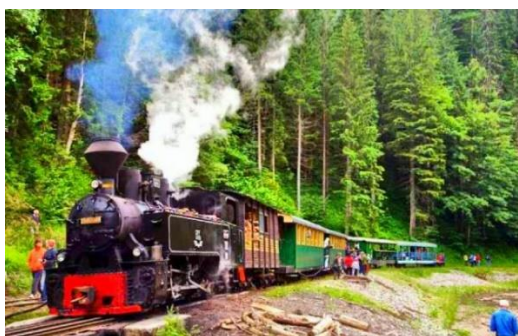
Figure 2. Mocanita

The most important tourist routes are: Cosnea - Pietrosul Bardaului peak - Bardau (Vaser Valley); Valea Vișeuului - Bistra - Valea Tomnatic - Repedea forest caton; Vaser Valley and return by mocanita [15]