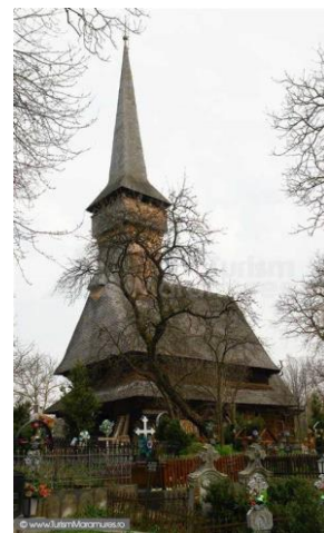
Figure 8. The wooden church in Desesti