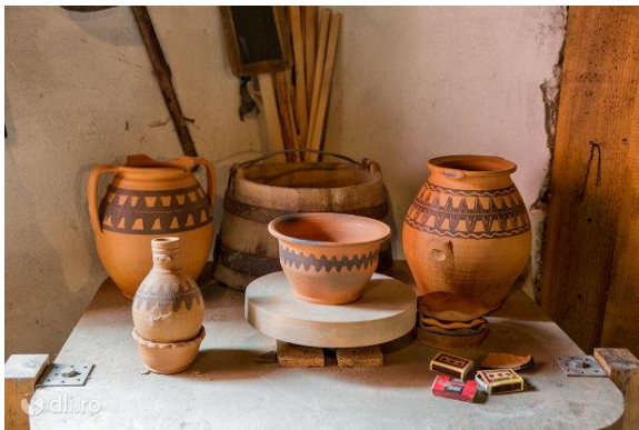
Figure 11. Ceramics

c) Ceramics – is similar to Dacian ceramics, either by the shape of vessels or decorative elements or working techniques. The dishes are processed on the pottery wheel, simply ornate, polished, dried, and then fired in the oven without being glazed. [11]