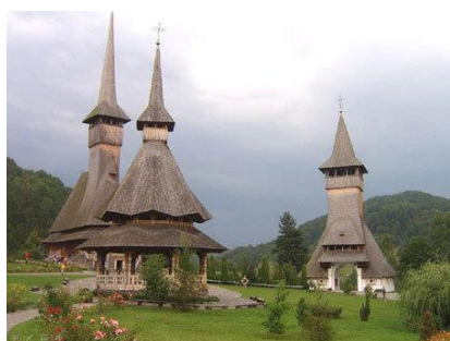
Figure 5. Barsana Monastery

3. The wooden churches of the Iza Valley. Barsana The wooden church from Barsana is dedicated to "The Entrance into the Church of the Virgin Mary". It was built on a place called "Monastery Bridges" around 1720 and later it was relocated to Jbar Hill, where you can still visit it now. It was included on the UNESCO World Heritage List in 1999. [11]