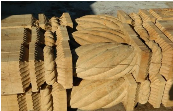
Figure 10. Woodcarving

b) Fabrics -are colored and crafted differently, depending on the place and honor given to each. The authentic ones are painted in natural colors, colors obtained from plants or tree bark. [14]