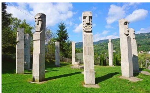
Figure 4. Moisie Monument

Located on a hill at the entrance to Moisei commune from Borsa town, it was originally built of wood in 1966 and later transposed into stone in 1972 by sculptor Vida Gheza in memory of the 29 martyrs killed on October 14, 1944 by Hungarian troops in the whirlwind of the end of World War II. [11]