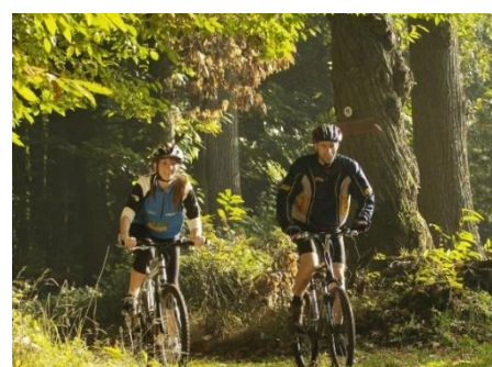
Figure 3. Cycling in the Vaser Valley