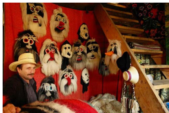
Figure 12. Masks