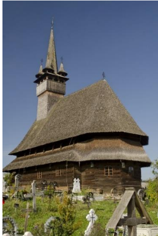
Figure 7. The wooden church in Budesti

The wooden church in Budesti, dedicated to Saint Nicholas, was built in 1643. The paintings inside it were made in 1762 by Alexandru Pohnalschi. [14]