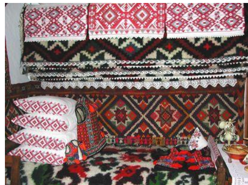
Figure 10. Fabrics