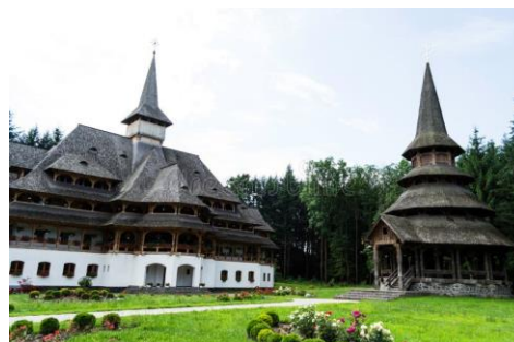
Figure 6. Sapanta Monastery