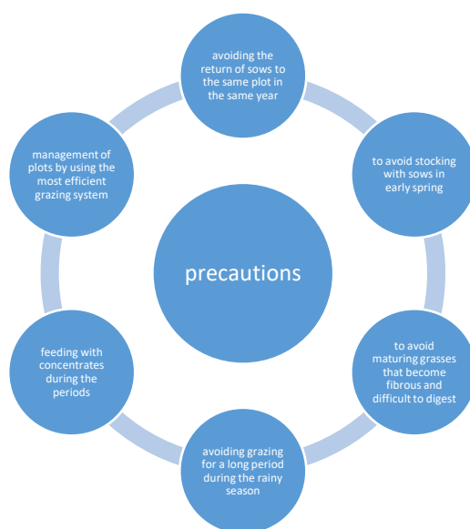
Figure 2. Precautions in the implementation of the most effective alternative technology for obtaining additional meat on pasture