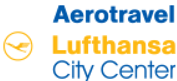
Figure 1. Logo of Aerotravel