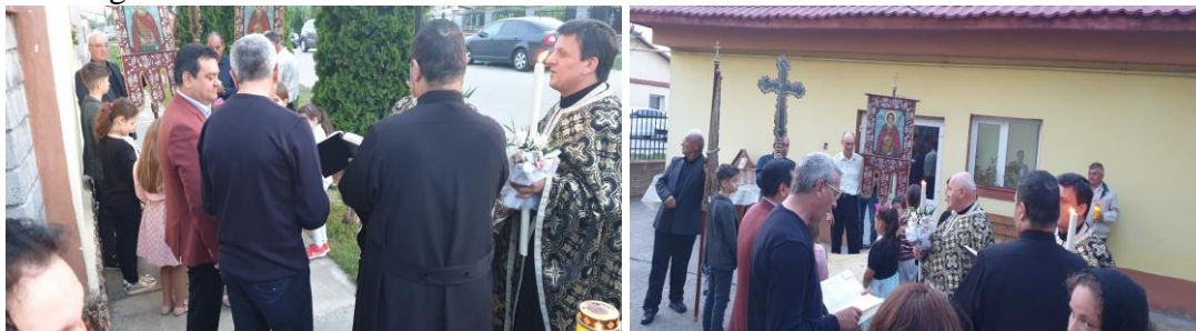
Figure 3. Moments from surrounding the Church on Holy Friday

Another important moment of Holy Friday's service is represented by the surrounding of the church.