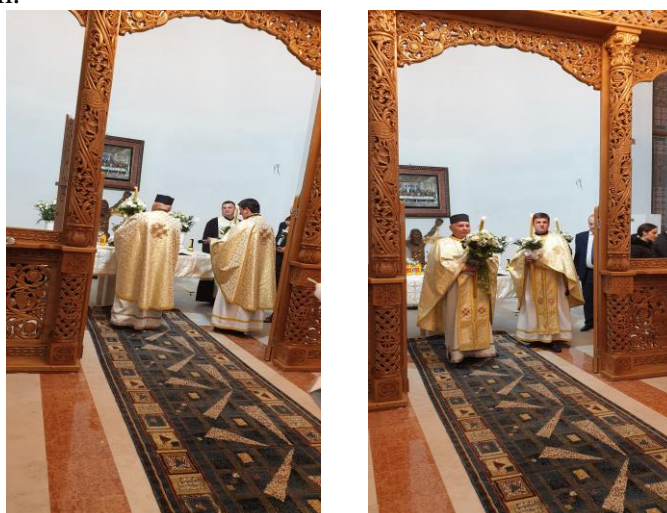
Figure 4. Calling Christians to Take the Holy Light

Holy Friday is followed by the Holy Saturday, when the Lord's Resurrection Service is being held at night, which is, in fact, our resurrection to a new life.[11] On this occasion Christians take the Holy Light of the Resurrection, lighting their candles from the candles worn by the priests. In the last time, believers can enjoy the Holy Light coming directly from Jerusalem.