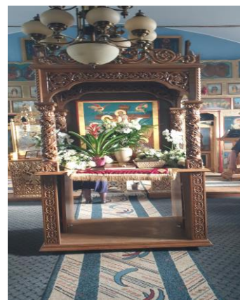
Figure 2. The Holy Grave with the Epitaph - placed in the middle of the church

In the high Holy Friday is made the putting in the grave, are singing, by priests and believers, the three states of the Lord's Burial Service. It sits in the middle of the church of the Holy Grave, on which is placed the Holy Epitaph, a cloth that has the image of the Savior on it.