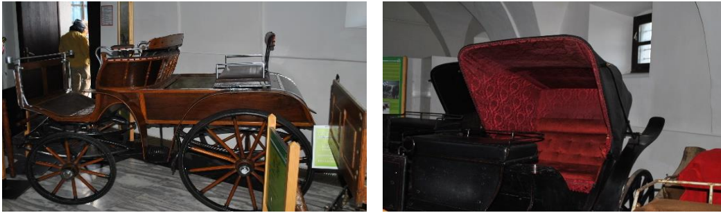
Types of traditional carriages used in urban centers

transport but some are rediscovered and used for the recreational holiday like the ones below.