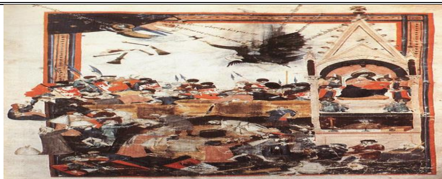
Figure 1. Grain market at Orsanmichele, Florence, Italy, during the food shortage