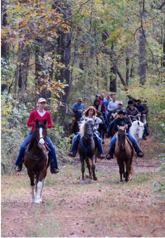
Fig 1. Equestrian tourism in Stud Izvin, Timis, Romania

Even if Romania does not know the spread of equestrian tourism in developed countries, our country can be proud of some selected herds that even halt foreign tourists eager for fun and relaxation. Most of them offer riding courses, rent horses for rides or offer equestrian shows.