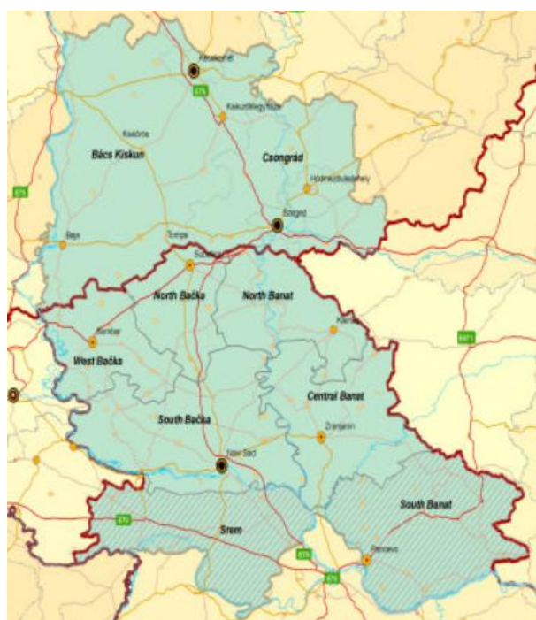
Figure1 The area of IPA cross-border cooperation [8]

The survey has been completed on both sides with 200-200 questionnaires each. On the Hungarian side Tiszakécske, Fülöpháza and Borota were included in the sample. Sampling was random and therefore it is not representative in any way. A more detail discussion of the Serbian results can be found in Vlahović's analysis [4].