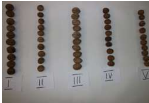
Figure 1. Five Romanian walnut varieties