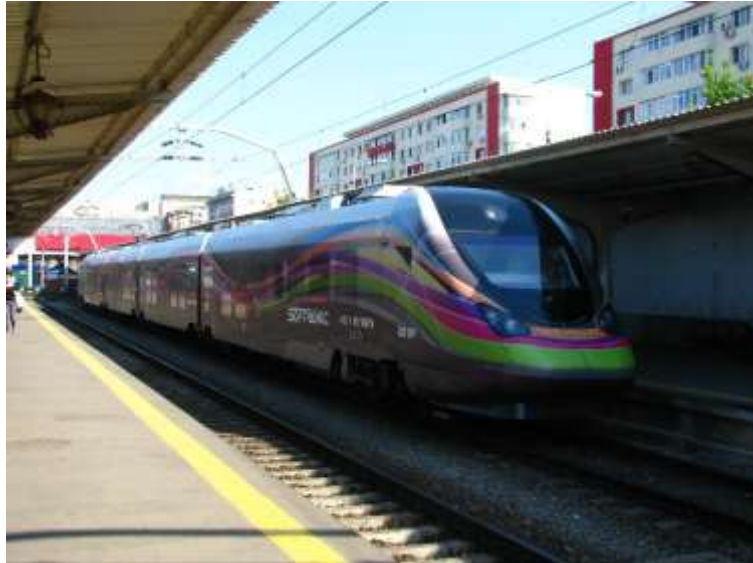
Intercity high-speed train - Romania

authors mention besides the fast rail networks also other lines that run high-speed trains: Inter City and City Express in Germany, Eurostar belonging to Italy as well as the Paris-London section, and London-Brussels, Thalys, the network using the Paris-Cologne, Paris-Rotterdam, Talgo, train hotel on the route Paris-Madrid and Madrid-Barcelona.[5,15,16]