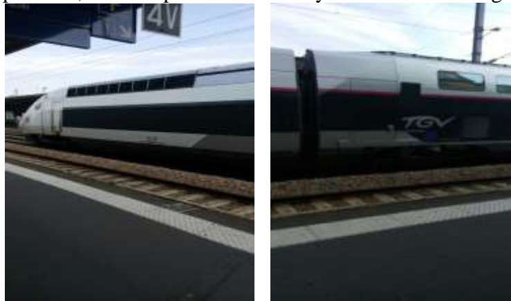
TGV high-speed trains

In Germany, was built the TGV line connecting Hannover to Würzburg, the train running 300 km per hour, but also part of the railway line between Stuttgart and Frankfurt.