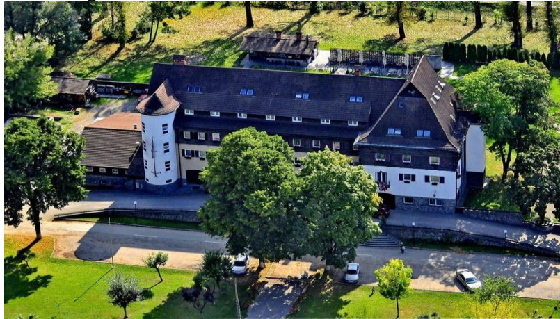
Figure 3. Hotel "Gradina Morii"

Hotel "Gradina Morii" is located at the foot of a hill, on the Iza river bank. Built in the interbelic period, the place still preserves the air of that time. The hotel enjoys the highest appreciation of guests in the area.