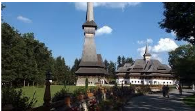
Figure 10. View of the Monastery Sapanta-Peri and the dendrological park near it

15:50 Departure to Timisoara 18:20 - 18:30 Break in Valea lui Mihai (SM) 20:00 - 20:30 Dinner, Madaras (BH), restaurant "Millenium", restaurant that entered the Book of Records for serving the world's largest goblet 22:35 Arrival in Timisoara