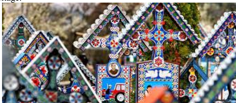
Figure 9. Crosses from the Merry Cemetery

Being an unique place in the world, the Merry Cemetery of Sapanta is part of the UNESCO heritage.