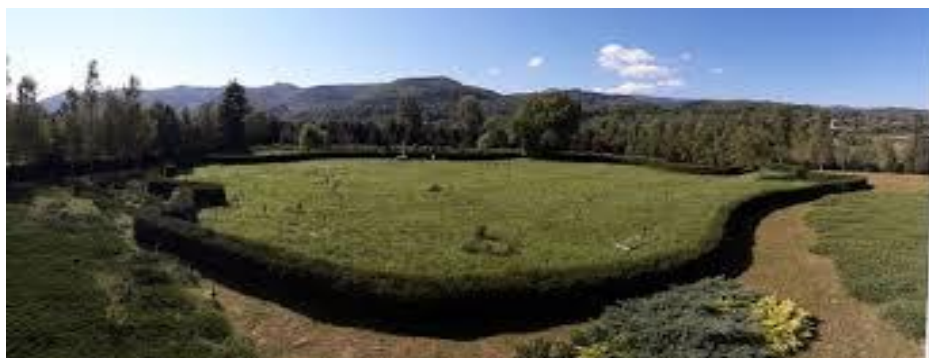
Figure 8. View of the map of the fir trees and the surrounding panorama from the top of the "Scale of Life"