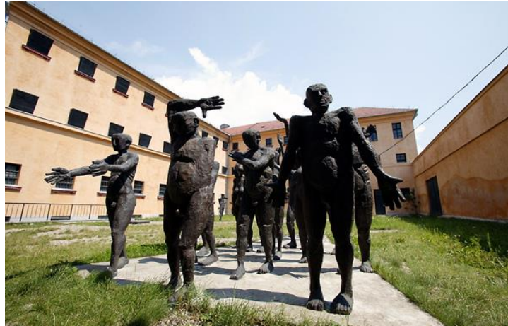
Figure 6. Ensemble of statues in the prison yard, representing "The corps of sacrifices"

11:05 Departure to Eli Wiesel Memorial House