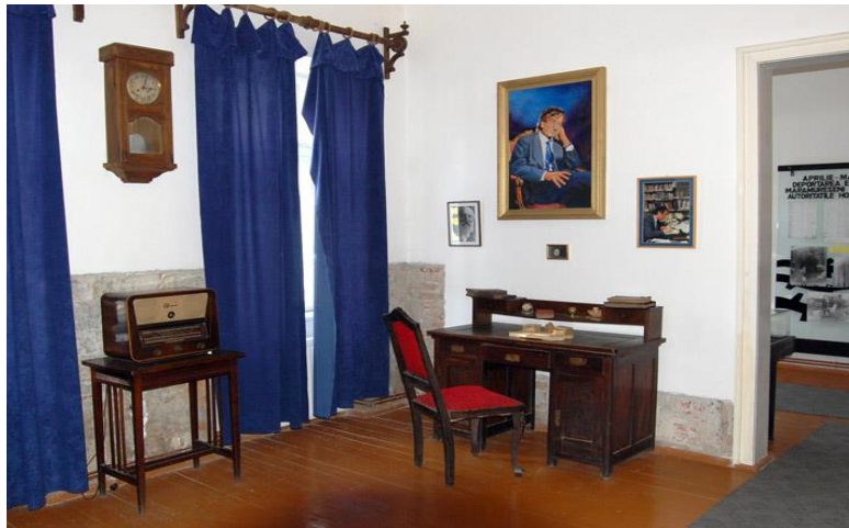
Figure 7. Interior look of the "Eli Wiesel" memorial house

The rooms include aspects of the cultural and social relationships that it has had, as well as important historical aspects of the interbelic period, with particular reference to the deportation of the Jews from Maramures.