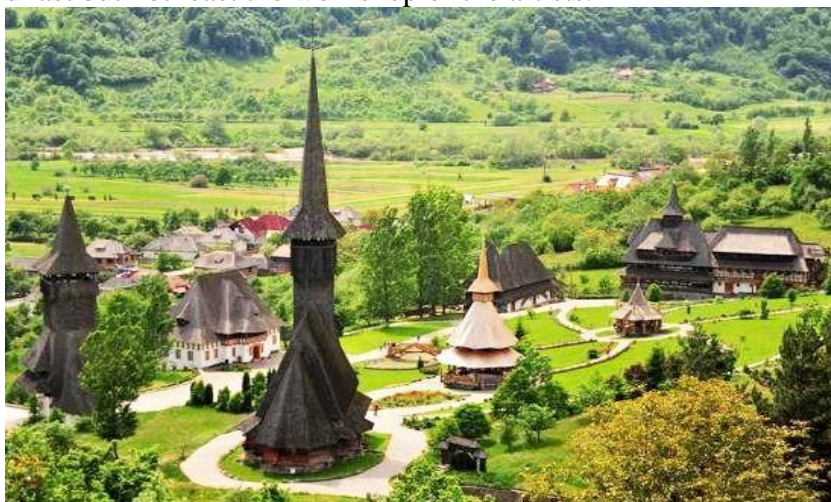
Figure 5. Barsana Monastery

The Orthodox Monastic Complex is composed of wooden constructions such as the entrance gate, the belfry tower, the church itself, the summer altar, the monks' churches, the chapel and last but not least the workshop of the artists.