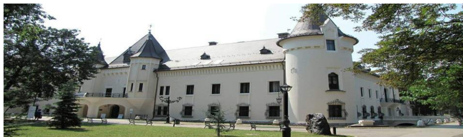
Figure 2. Karolyi Castle from Carei

Around it there is a rich dendrological park, with over 200 species of exotic and autochthonous trees and shrubs