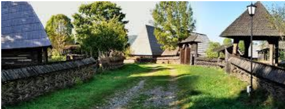
Figure 4. View from Village Museum , Sighetu Marmatiei

A museum complex with ethnological dominance, where can be seen wooden houses from different periods beginning with the 15th century, as well as a wooden church, specific to the area.