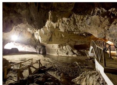
Museum of Mining