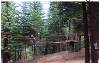
The Keys of Butii