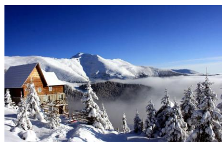
Reserve of bison