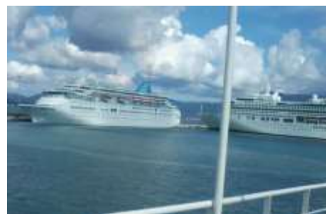
Figure 1. Types of cruise ships

The cruise of a day or several weeks does not mean only the actual tourist transport of tourists at destination with a cruise ship (Figure 1), with several bridges, but also a whole range of cultural activities in the cities of mooring, amusing and recreational on the ship, on land, that involve, most of them, one or more types of transport, at least up to the place where that activity is carried out, for the passengers from the board of a cruise ship (Figure 1) [2,3,5,9]: